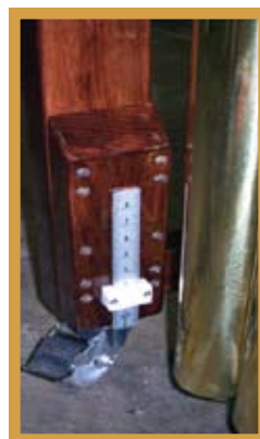
Built-in height measurement guide.