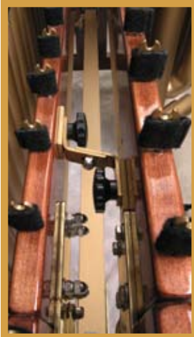
Heavy-Duty Construction with Style and Durability.