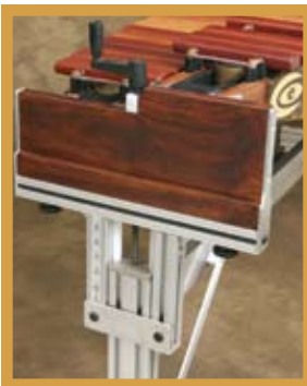
Height adjustable, or custom built to your height requirement. (no lower than 34" to natural bars due to resonator lengths) Overall Length of Instrument: 102" Bar Sizes: From 3 1/4" (lowest bars) graduated to 1 5/8" (high end bars) Six different resonator diameters for even resonance throughout the entire range of the keyboard. Instrument weight: 425 lbs.

Five-Octave Concert Marimba: Honduras Rosewood Bars, Brass Resonators, and Maple frame. Our wood frames have unlimited options in both stain applied and type of wood. Please inquire about choices and prices. All instruments come standard with highly polished "mirror finish" brass resonators. Hydraulic height-adjustable frames are available on all of our instruments. (lighter weight aluminum resonator model also available)