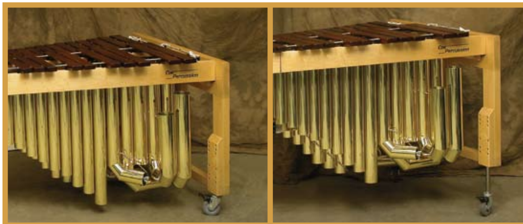
Height system all the way down.

Our AWESOME one crank height adjustment system. A twin crank system is also available, which offers greater flexibility for those who travel with the instrument often.